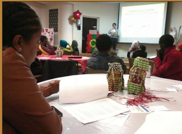
A volunteer attorney makes a presentation to an Oromo student group at the University of Minnesota about the findings of a report to the UN Committee on Economic, Social and Cultural Rights, based on The Advocates' remote monitoring report.

The report includes nearly 50 pages of findings on violations of human rights, including torture, extra-judicial execution, arbitrary arrests and incommunicado detention, lack of due process, and inadequate prison conditions. The report also documents the state surveillance apparatus and violations of the rights to freedom of speech, assembly, association and expression, as well as violations of economic, social and cultural rights. Although it is not based on on-the-ground fieldwork in Ethiopia, this carefully researched and credible report has been cited as supporting evidence in immigration court and as a basis for recommendations by UN human rights mechanisms. 178