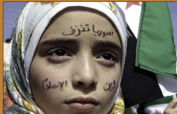
Syrians rally outside the U.S. Embassy in Amman, Jordan to demand a U.S. military intervention to stop the violence in Syria. Arabic writing on the girl's face reads: "Syria is bleeding. Where are the Muslims?"

In 2012, a group of Syrian-born activists and artists in the United States created an email listserve to raise awareness among the diaspora and others in the U.S. about the human rights abuses against civilians taking place during the conflict in Syria. Members of the Syrian diaspora, as well as others, could join the listserve by providing their email addresses. The group compiled and regularly distributed through the listserve news reports, links to amateur videos posted on YouTube, and other information about what was happening on the ground in Syria. They combined the use of the email listserve with public events such as poetry readings and artistic performances to raise awareness and mobilize community members to press the U.S. government to take stronger action to end the violence against civilians in Syria.