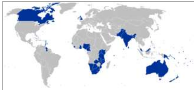
Map of the Commonwealth countries

In recent years, suspension has had the most striking consequences for Fiji. Fiji was first suspended from the Councils of the Commonwealth in 2000, when a coup imposed a constitution contrary to Commonwealth principles. In 2006, after another coup, the Commonwealth suspended Fiji for a second time, subsequently expanding the sanction to a full suspension in 2009. 650 In 2012, the Commonwealth determined that "Fiji could not be reinstated into the Commonwealth until it had restored democracy by holding elections and addressed pressing human rights and legal issues." 651 "Fiji's suspension had significant economic and diplomatic