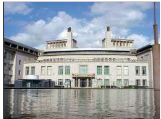
The International Criminal Tribunal for the former Yugoslavia

The United Nations established the International Criminal Tribunal for the former Yugoslavia in 1993 in The Hague, the Netherlands. The ICTY's mandate is to prosecute individuals responsible for serious violations of international humanitarian law committed in the former Yugoslavia since 1991. 530 The ICTY prosecutes four types of crimes: (1) grave breaches of the Geneva Convention; (2) violations of the laws or customs of war; (3) genocide; 531 and (4) crimes against humanity. 532 The ICTY can prosecute any person who planned, instigated, ordered, committed, or otherwise aided and abetted in any of these crimes, including Heads of State or