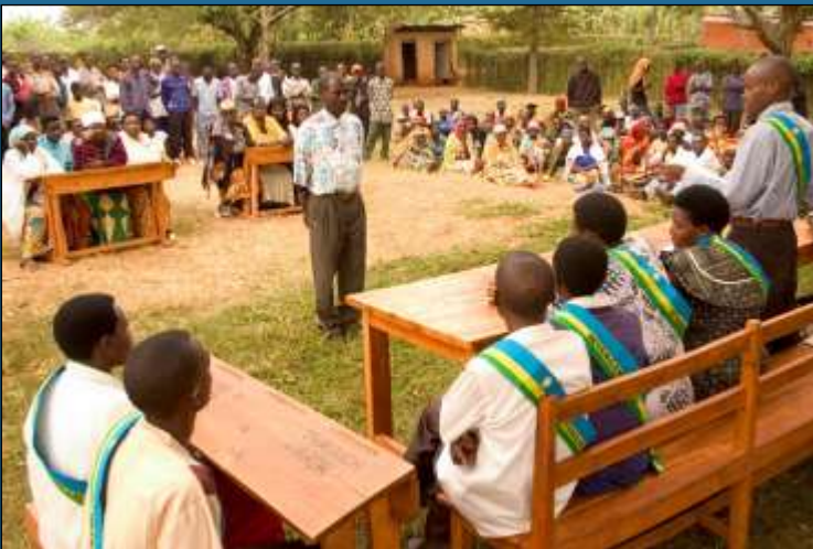
A gacaca court in session

Because Rwanda had not yet formally criminalized genocide, Rwandan prosecutors could not bring cases immediately. 411 Since 1996, however, Rwandan courts have been administering justice to perpetrators of the 1994 genocide. 412 Perpetrators who remained in the country faced prosecution. For example, over 11,000 regional makeshift “gacaca” courts were created to prosecute lower level criminals accused of genocide. 413 As the International Center for Transitional Justice reports, “Nearly 800,000 Rwandans—one-fifth of the adult population—have been accused before these courts.” 414 These gacaca courts operated in parallel with the International Criminal Tribunal for Rwanda, discussed in Part C of this chapter.