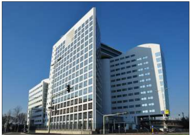
The International Criminal Court in The Hague, Netherlands

There are several ways that a matter may come before the ICC. First, a State Party to the Rome Statute may ask the ICC to investigate a particular matter inside its own territory. A non-member may also seek the ICC’s involvement and accept its jurisdiction with respect to one or more particular matters. The UN Security Council may refer a particular situation to the ICC as well. 604