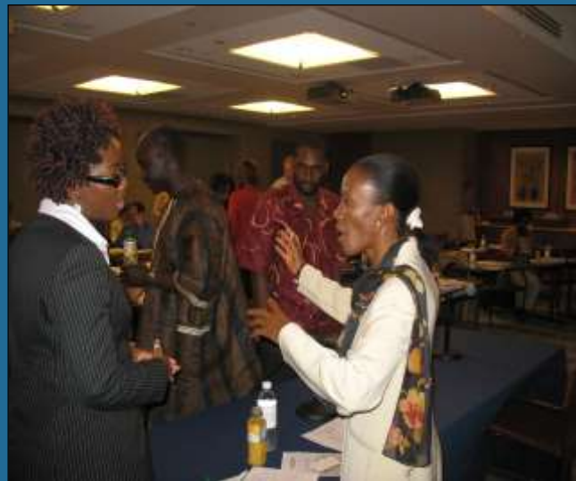
Members of the Liberian diaspora attending a training for LTRC volunteers

The Advocates and the LTRC established a Diaspora Project Advisory Committee of Liberians from across the United States to advise the process. The Advocates partnered with Liberian community organizations in the United States, United Kingdom, and Ghana to obtain input and advice about making the LTRC process as accessible as possible for Liberians in the diaspora. The LTRC public hearings held in St.