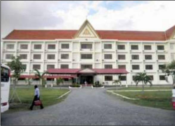
The Extraordinary Chambers in the Courts of Cambodia

Victims may become Civil Parties to the proceedings. To become a Civil Party, a victim must be a natural person or a legal entity “who suffered physical, material[,] or psychological harm as a direct consequence of at least one of the crimes alleged against the Charged Person.” 562 Civil Parties “enjoy rights broadly similar to the prosecution and the defence.” 563 These rights include the right to: