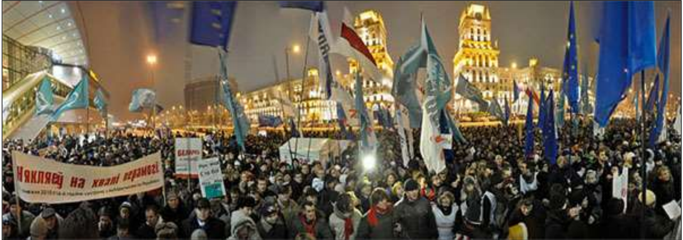
Protests in Minsk, Belarus in 2010